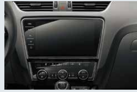
NEW GENERATION INFOTAINMENT (8"—9.2" WITH NEW, ALL-GLASS DESIGN)

The new Octavia demonstrates where ŠKODA stands today, and points to its future – with a variety of new technology features and Simply Clever solutions.