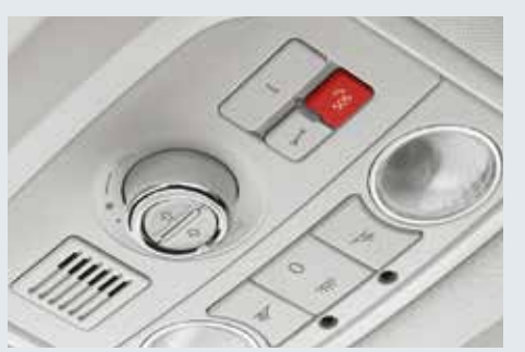
EMERGENCY CALL BUTTON