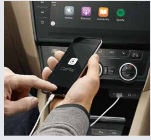
SMARTLINK+ WITH APPLE CARPLAY AND ANDROID AUTO