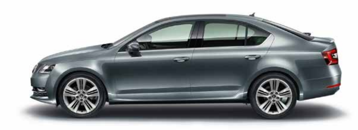
Model shown is not UK specification.