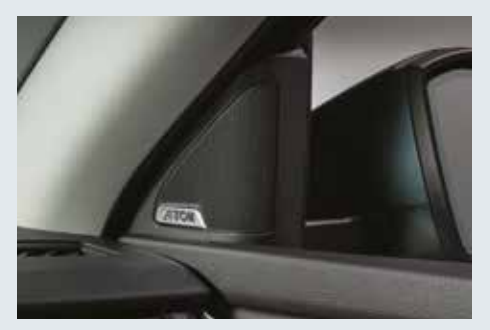
CANTON SOUND SYSTEM