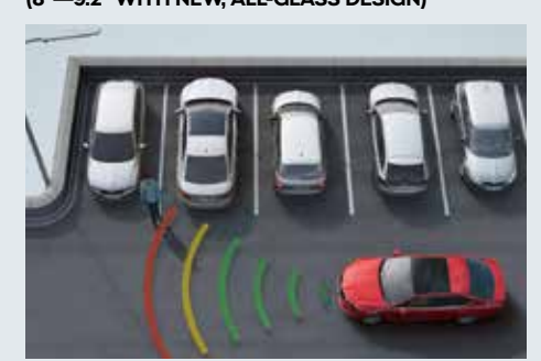
FRONT ASSIST WITH PREDICTIVE PEDESTRIAN PROTECTION