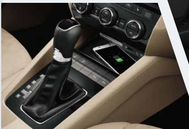
WIRELESS PHONE CHARGING